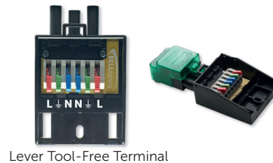
Lever Tool-Free Terminal